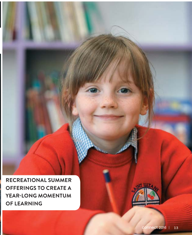
RECREATIONAL SUMMER OFFERINGS TO CREATE A YEAR-LONG MOMENTUM OF LEARNING