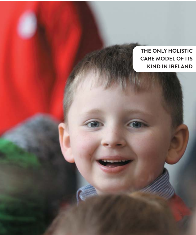
THE ONLY HOLISTIC CARE MODEL OF ITS KIND IN IRELAND