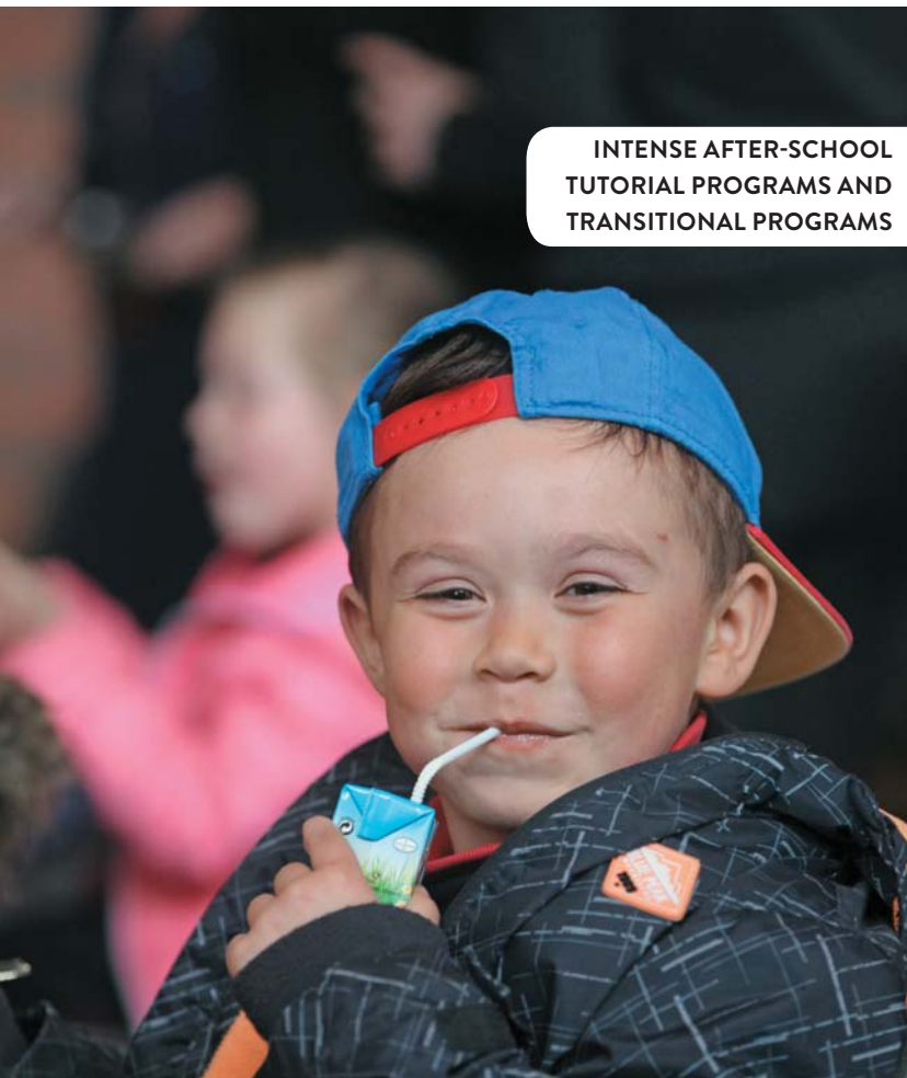
INTENSE AFTER-SCHOOL TUTORIAL PROGRAMS AND TRANSITIONAL PROGRAMS