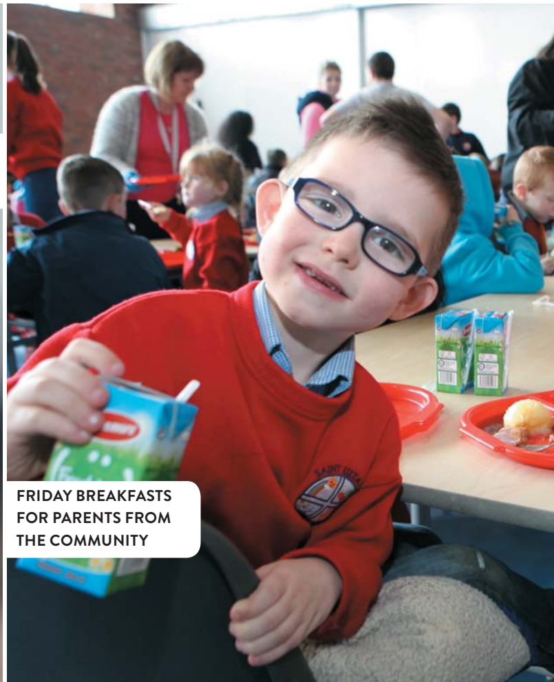
FRIDAY BREAKFASTS FOR PARENTS FROM THE COMMUNITY