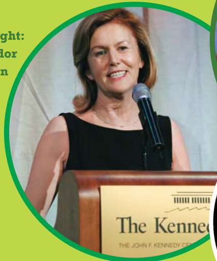
Opening night: President & CEO of The Worldwide Ireland Funds