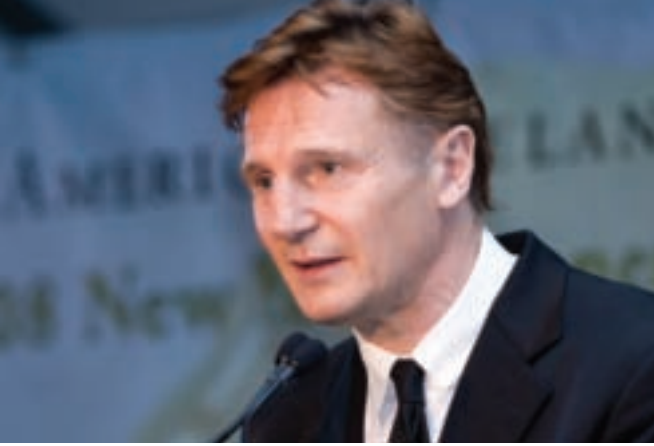
Liam Neeson, Performing Arts Award Recipient