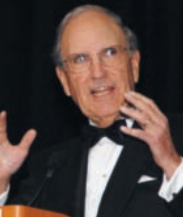
Sen. George Mitchell, 2008 Honoree