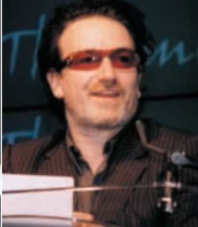
Bono, Humanitarian Award Recipient