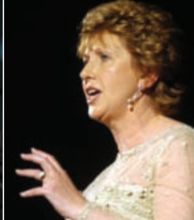
Pres. Mary McAleese, Humanitarian Award Recipient