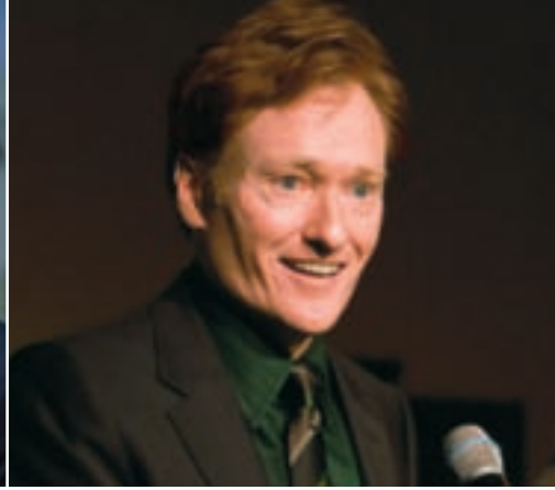
Conan O'Brien, Young Leaders Irish Spirit Award Recipient

“My parents were a tremendous influence on me and I wanted to do something to make sure they would always be remembered. Through The American Ireland Fund, I honor them by supporting the work of the Corrymeela Community and Barretstown Camp, advancing two causes that were important to them: peace and children.”